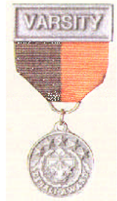
Varsity Denali Award

For questions about any of these upcoming events contact your Stake ADC.